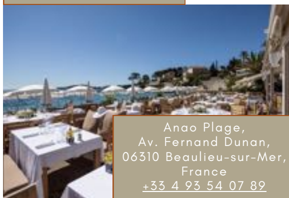
Anao Plage, Av. Fernand Dunan, 06310 Beaulieu-sur-Mer, France +33 4 93 54 07 89

For upscale dining or a 'date night' all year round, try Circe, which also does a fab Sunday Roast for €65