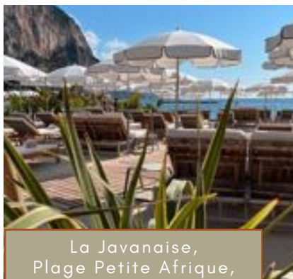
La Javanaise, Plage Petite Afrique, 06310 Beaulieu-sur-Mer, France +33 4 93 79 38 80

For upscale dining or a 'date night' all year round, try Circe, which also does a fab Sunday Roast for €65