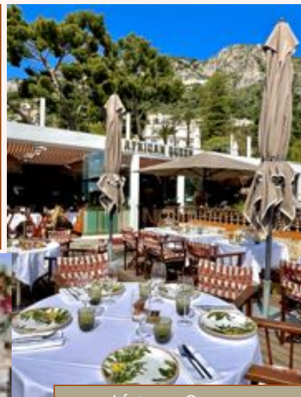
African Queen, Port de Plaisance, 06310 Beaulieu-sur-Mer, France +33 4 93 01 10 85

There are a number of upscale eating places in Beaulieu-Sur-Mer Marina. The African Queen is the most famous, but I equally enjoy La Maison De Beaulieu and Ambrosia.