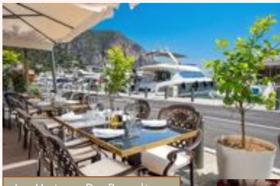
La Maison De Beaulieu, Port de Plaisance, 06310 Beaulieu-sur-Mer, France +33 4 93 01 06 50

There are a number of upscale eating places in Beaulieu-Sur-Mer Marina. The African Queen is the most famous, but I equally enjoy La Maison De Beaulieu and Ambrosia.