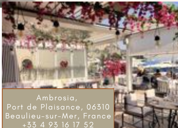
Ambrosia, Port de Plaisance, 06310 Beaulieu-sur-Mer, France +33 4 93 16 17 52